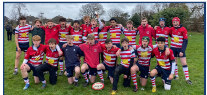
Rosslyn Park - Winners of the Quins Plate