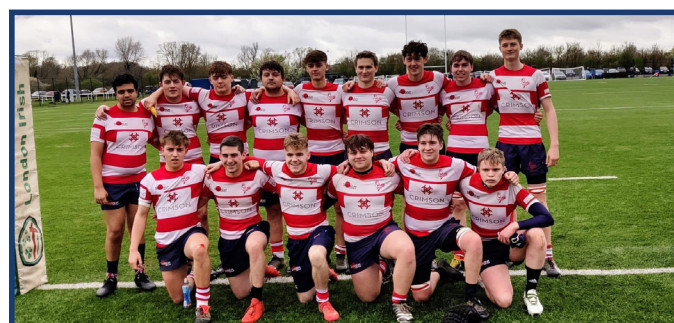
Dorking B Colts - winners of the Hampstead Bronze