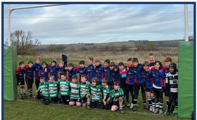
Minis Tour to Kent and Sussex