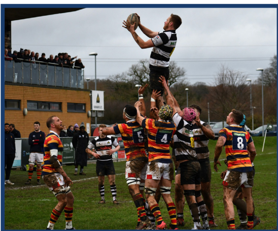
Left: This season's 1st XV fly high against KCS Old Boys