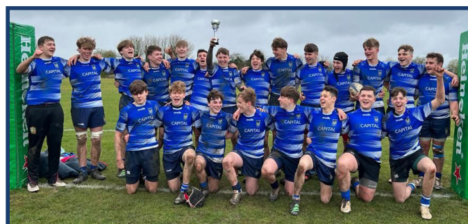
Haslemere Colts - winners of the Stoop Bronze