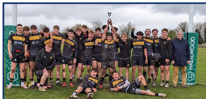
Esher Colts - winners of the Twickenham Bronze