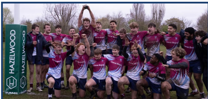
Wimbledon Colts - winners of the Twickenham Gold