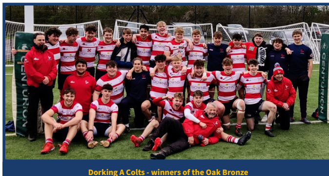
Dorking A Colts - winners of the Oak Bronze