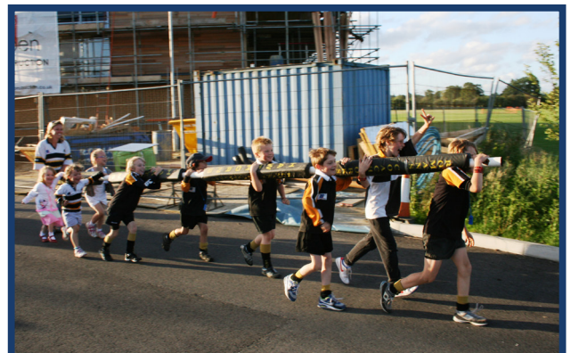
2012 - group of Minis carry the crossbar to the new ground from the old - a club tradition from the 1970's