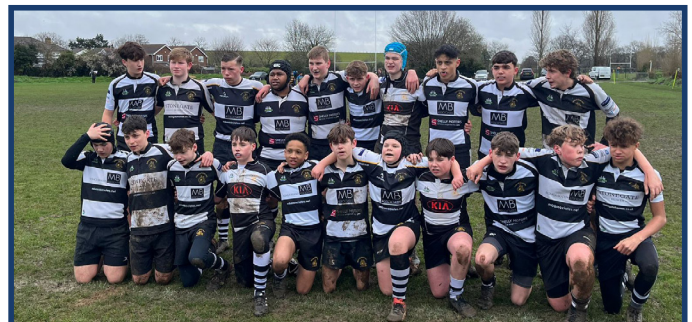
Sutton & Epsom Colts - Winners of the Twickenham Shield