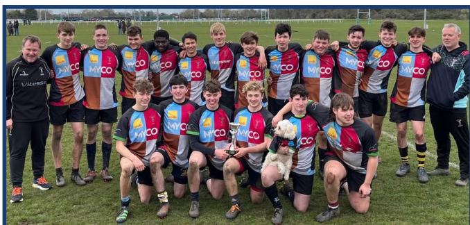
Quins Ams Colts - winners of the Stoop Gold