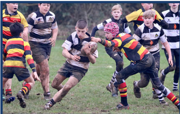
Under 14 Boys - Junior Rugby thrives at FRUFC

It goes without saying, that the club would be nowhere but for the army of volunteers that coach, administrate and provide first aid throughout the age groups – not to mention those who quietly go about their business behind the scenes to make things work. The club prides itself on being friendly and welcoming and has come a long, long way since its move in 2012. If you would like to be part of its future, please don't hesitate to drop in.