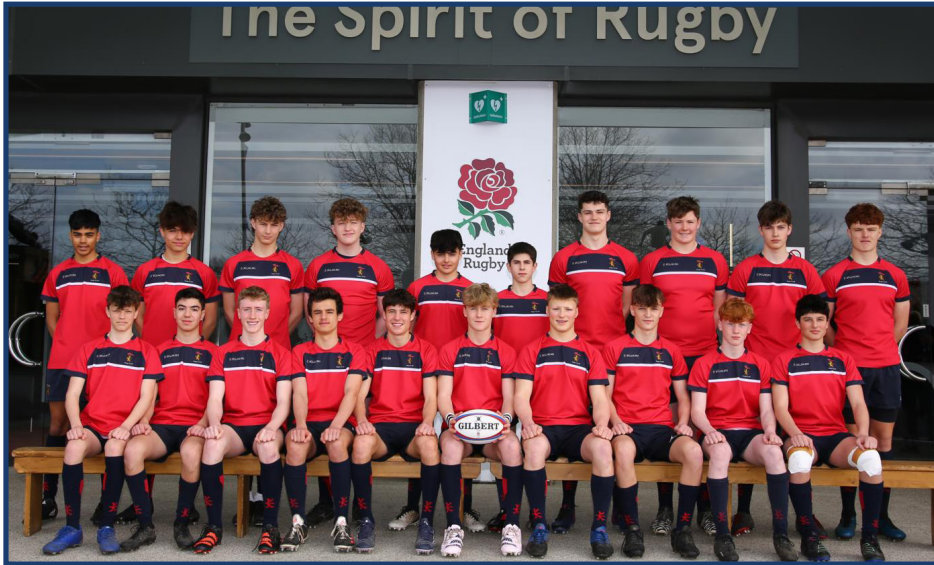
KCS Wimbledon School