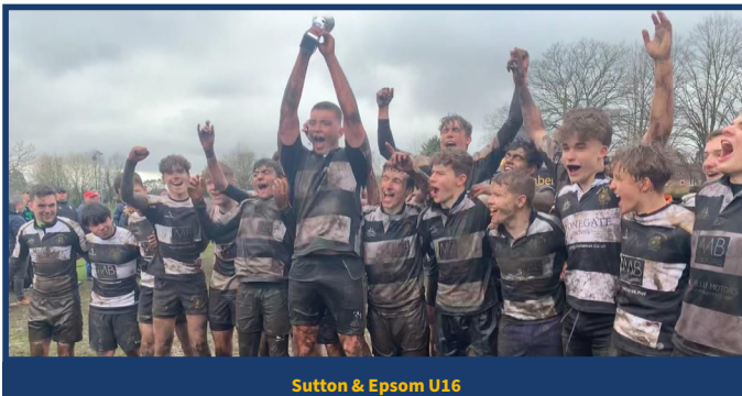
Sutton & Epsom U16