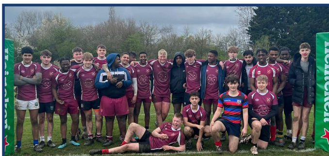
Croydon BaaBaas - runners up for Stoop Bronze