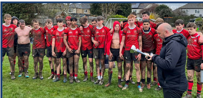
London Welsh U15 - Winners of the Stoop Shield