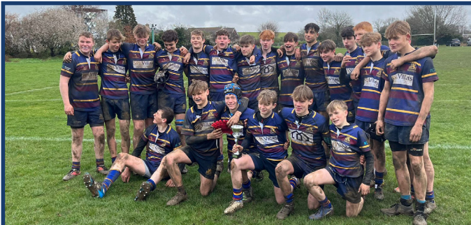
Cobham U15 - Winners of the Stoop Trophy