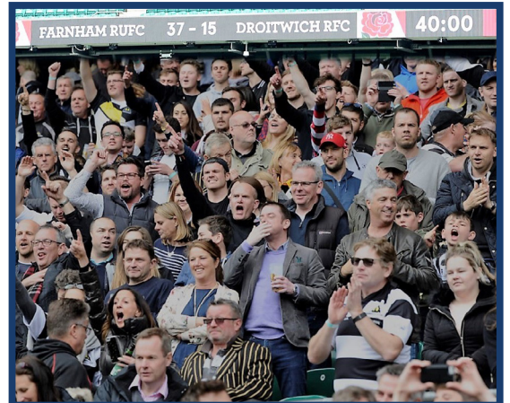
Right: Happy days for members and supporters at Twickenham, May 2017