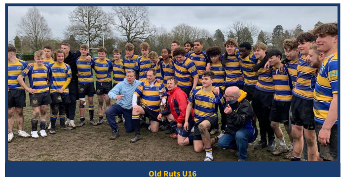
Old Ruts U16