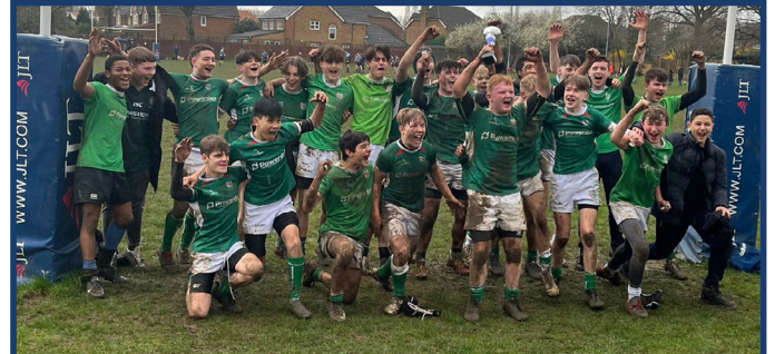
London Irish U15 - Winners of the Quins Trophy