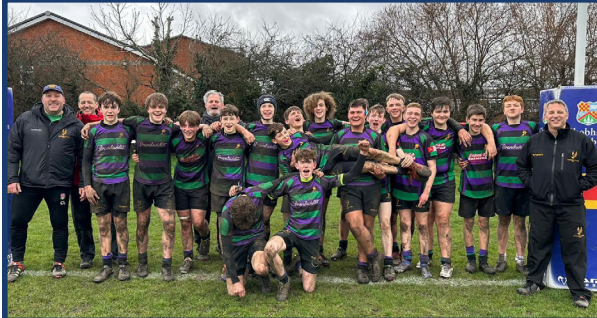
Weybridge Vandals - Winners of the Stoop Bowl

The Quins Cup Final with Warlingham A vs Camberley A took place at the Stoop on Friday 21st April. Check out page 51 for results. More team photos on our website