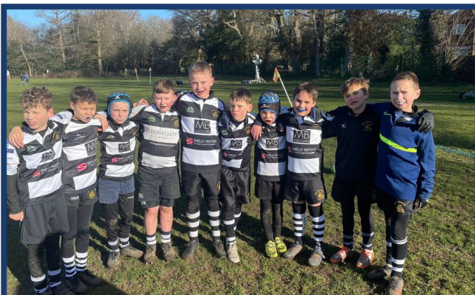
Sutton & Epsom