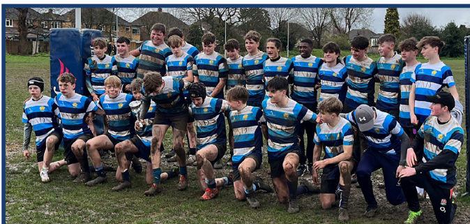
Reigate U15 - Winners of Hampstead Plate