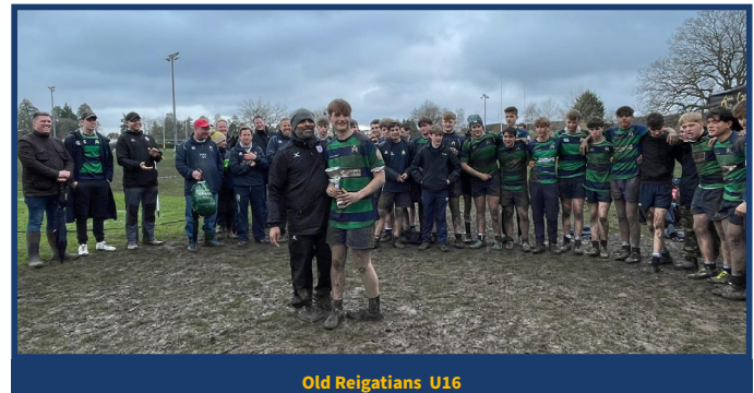
Old Reigatians U16