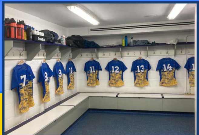
Shirts auctioned off after the game raised over £1,500