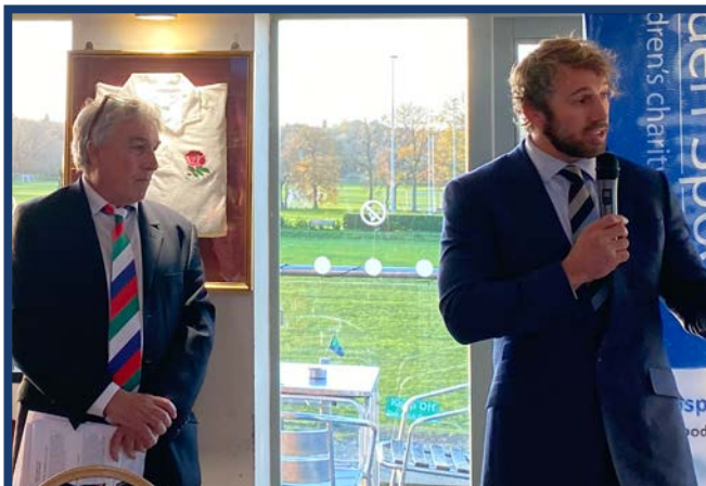
Chris Robshaw and John Inverdale entertain at Old Reigatian RFC

Wooden Spoon is the children's charity of rugby. We are a grant making charity and fund life-changing projects across the UK & Ireland. Since our beginnings in 1983, we have raised and donated nearly £31 million to fund more than 1450 projects which will help improve the lives of youngsters with disabilities or living in socially disadvantaged circumstances.