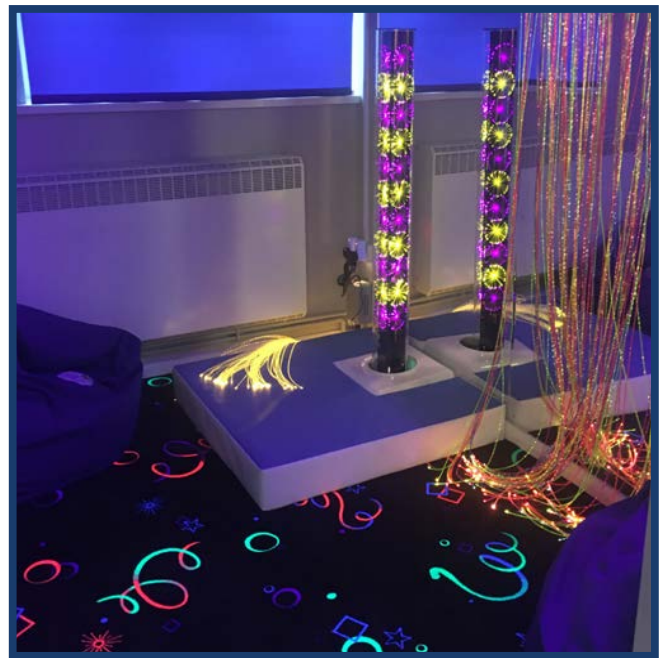
The Sensory Room at St. Stephen's School, Godstone