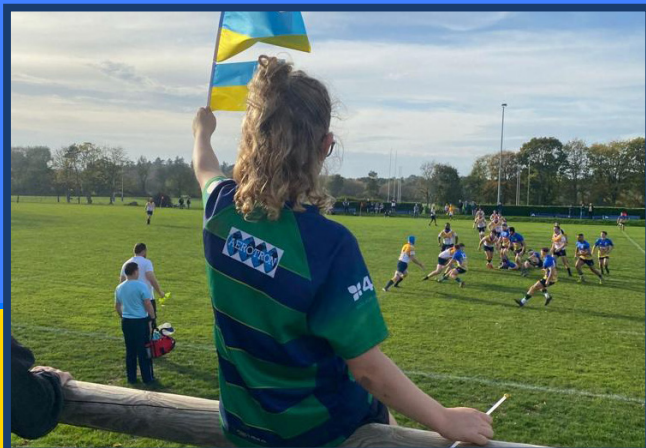
Cheered on by over 200 fans and members of the local Ukrainian community

If your club would like to find out more about how they can support Train for Ukraine contact us on rich@thediscover-socialgroup.co.uk . We look forward to speaking and working with you.