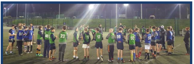
Quins DPP Training