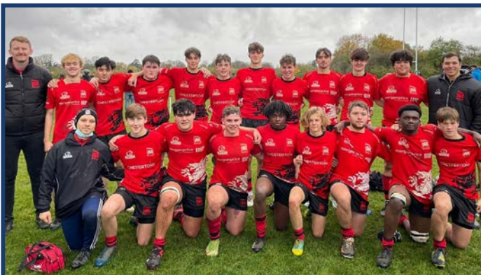
London Welsh Colts