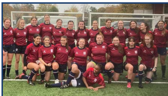
Surrey Under 18 Girls