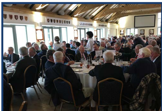
Rugby Clubs' Curry Lunch at Old Reigatian RFC