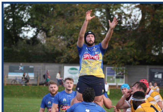
In a exciting 23-23 draw

Most Ukrainian Refugees have arrived in the UK with nothing, and knowing no one. Train for Ukraine will help rugby clubs reach out to the Ukrainian community, welcoming them into the Rugby family. We work with clubs to the funds needed to get the communities children playing the sport and being part of a team! Simple really, the funds raised fund the membership and the kit for an individual!