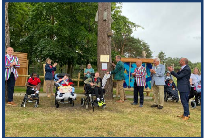
The Sensory Trail at Portesbery School, Deepcut