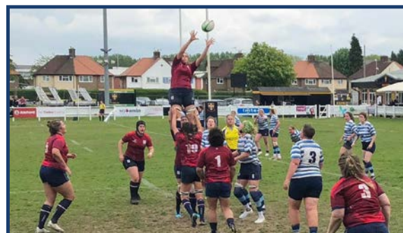
Surrey Women in action