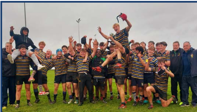
Old Cranleighans & Weybridge Vandals combined Colts