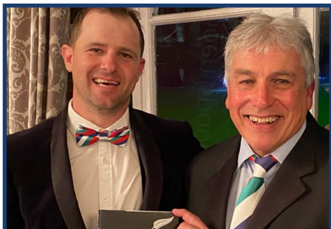
All Black Nick Evans and our President, John Inverdale, host our Sportsman's Dinner