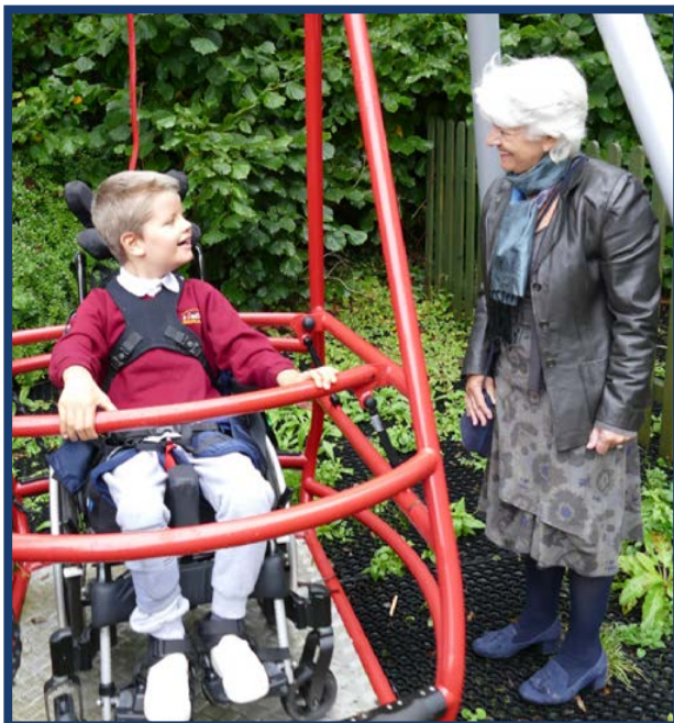
The buddy swing at Brooklands School, Reigate