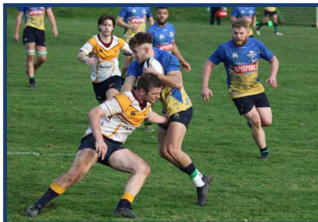
ORRFC played in one off shirts designed by Akuma