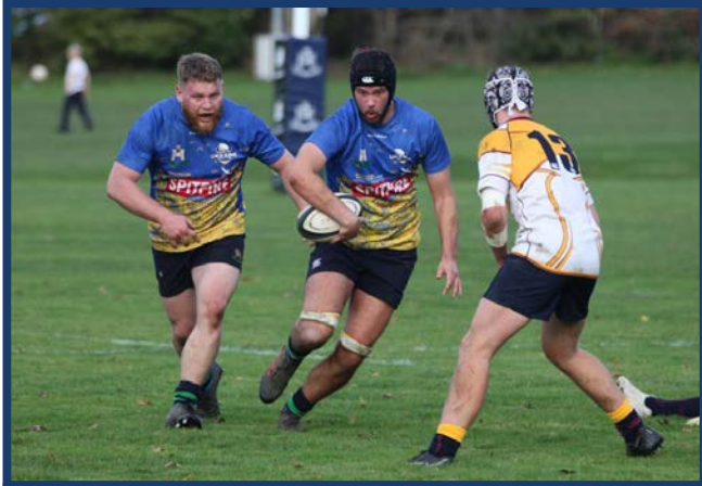
ORRFC vs Old Colfeians on 29th October

Welcome to 'Train for Ukraine'. An initiative raising money to provide sporting opportunities to Ukraine Refugees in the UK.