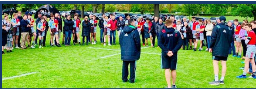
Quins DPP Festival

The Quins Academy door will remain open to these players throughout their pathway.