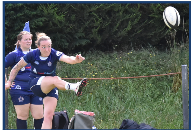
MPRFC Ladies XV v Hackney