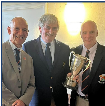
Surrey President Award Winners Chobham Chargers

A full list of 2021-22 winners, as well as a complete historical list of winners, can be found on the Surrey website. We will be holding the 2022-23 Awards evening in June 2023 and look forward to seeing many of you there.