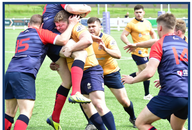
PSUK Cup Final v South Wales