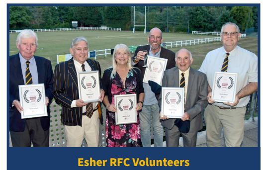
Esher RFC Volunteers