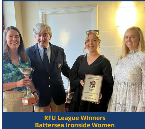
RFU League Winners Battersea Ironside Women