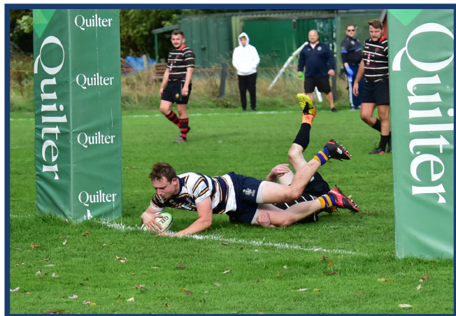
MPRFC v London Media