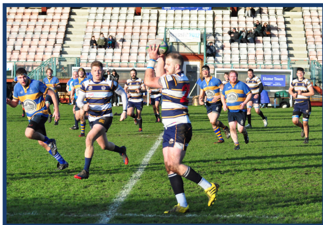
MPRFC v Egham