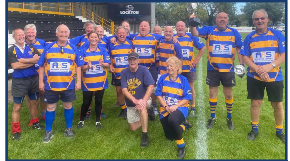
Recent Festival Winners Gosport