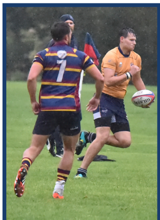
MPRFC v Old Freemans