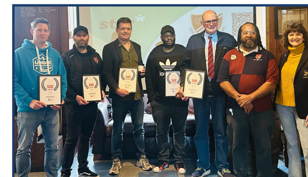
Streatham & Croydon