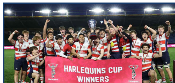
U18 Boys Winners - Rosslyn Park