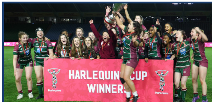
U16 Girls Winners - Guildfordians/Streatham-Croydon