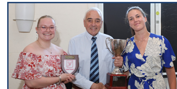
Women's NC1 South East (South) - Guildford Gazelles