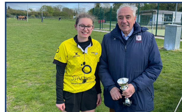
Surrey Chair with one of Farnham's Active refs as part of the Young Match Official program