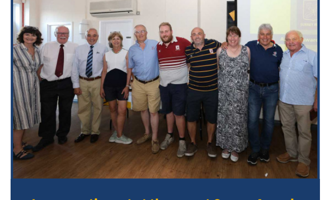
Large contingent at the recent Surrey Awards Evening at Esher