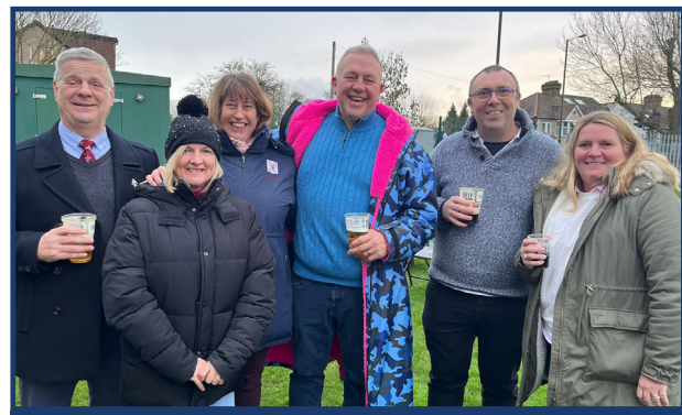
In the Honda hospitality tent before the game