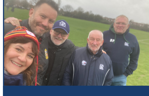
With Berkshire CB at the U20 Men's game