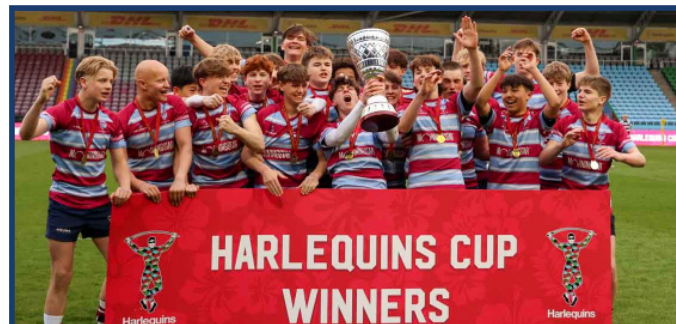
U15 Boys Winners - Wimbledon