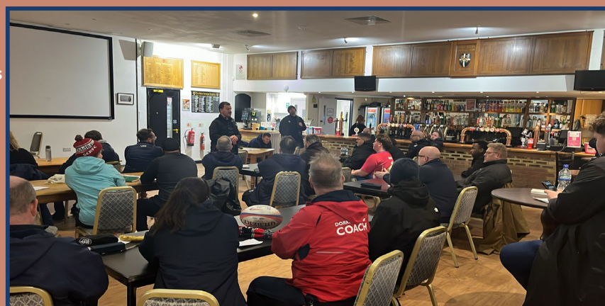
CPD COACHING AT ESHER RFC

*Over 80 matches were played throughout the season as part of this format with over 350 under 22s in attendance over the Christmas and Easter period with a competitive playing offer.