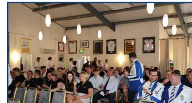
It was a packed out venue at Esher!

Many congratulations to all those teams and individuals who won an award. It was fantastic to see so many of you there on the night, with friends and family supporting.