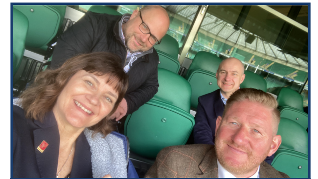
The Surrey Schools Finals at Twickenham