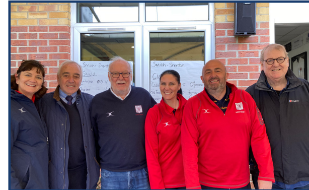
The Surrey Committee out in force to help on U22 Finals Day at Esher