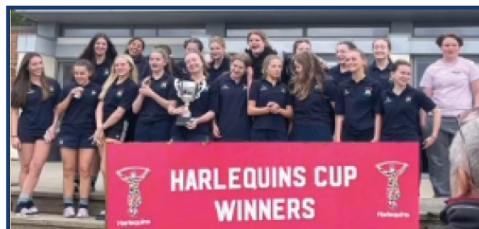
U18 Girls Winners - Old Reigatians