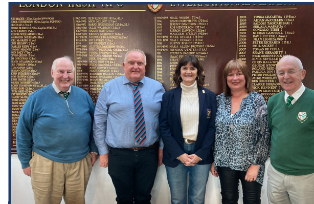
At London Irish enjoying their pre-match hospitality