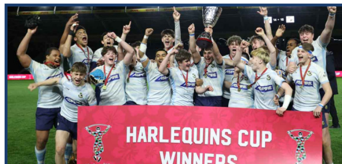
U16 Boys Winners - Warlingham