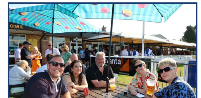
Enjoying the barbeque and a cold drink on one of the few hot days in early summer