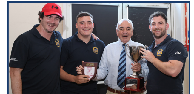
Surrey Counties 2 - Old Rutlishians RFC